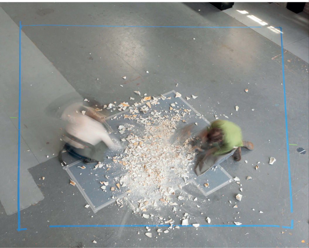
Front and Back Covers: Futurefarmers, Erratum: Brief Interruptions in the Waste Stream , 2010. Photograph by Michael Bartalos. Courtesy of the artists. Above: Futurefarmers, Erratum (still), 2010. HD video (color, silent). 16:9, 4.18 min. Courtesy of the artists.