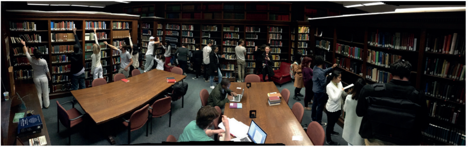
Futurefarmers, In Search of all the Errata in the Robbins Library , 2016.