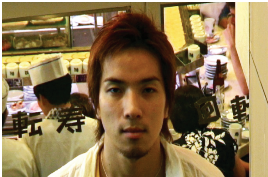
Time Travellers , 2016. HD video, color, stereo. 19 min.