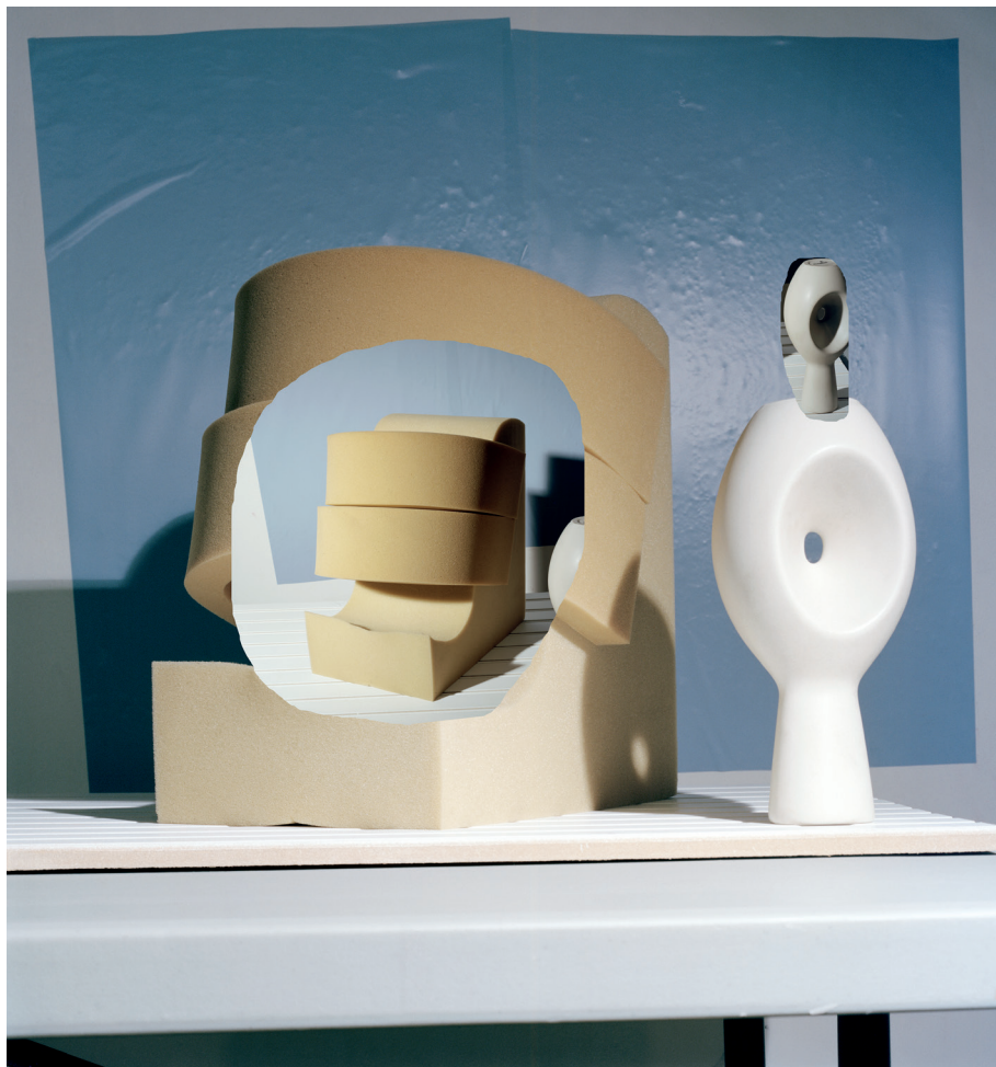
Self-conscious Objects (pictured) , 2015–16. Archival inkjet print. 31¼ x 29¼ in. (framed).