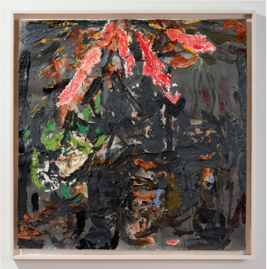
Walking in and out of green pastures (pictured), 2014. Graphite, ink, watercolor, papier mâché, oil stick, and collage on paper. 38 x 38 in. Courtesy the artist and Tilton Gallery, New York.