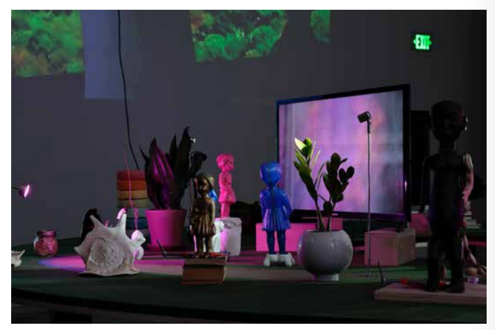
Installation view, Cauleen Smith: Give It or Leave It, Institute of Contemporary Art at the University of Pennsylvania, Sept 14 – Dec 23, 2018.

transcend the limits of the ordinary. I don't know what those inspirations are for you. How you get at them, how you find them, how you see them.