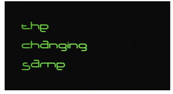
Cauleen Smith, The Changing Same (stills), 2001. Digitized 35 mm video (color, sound; 9:25 minutes).

Voice: You have overcome these obstacles