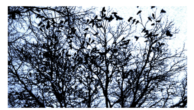
Cauleen Smith, Crow Requiem (still), 2015. Digital video (color, sound; 11:08 minutes). Courtesy of the artist and Corbett vs. Dempsey, Chicago.