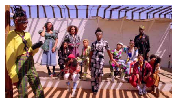
Cauleen Smith, Sojourner (still), 2018. Digital video (color, sound; 22:41 minutes).